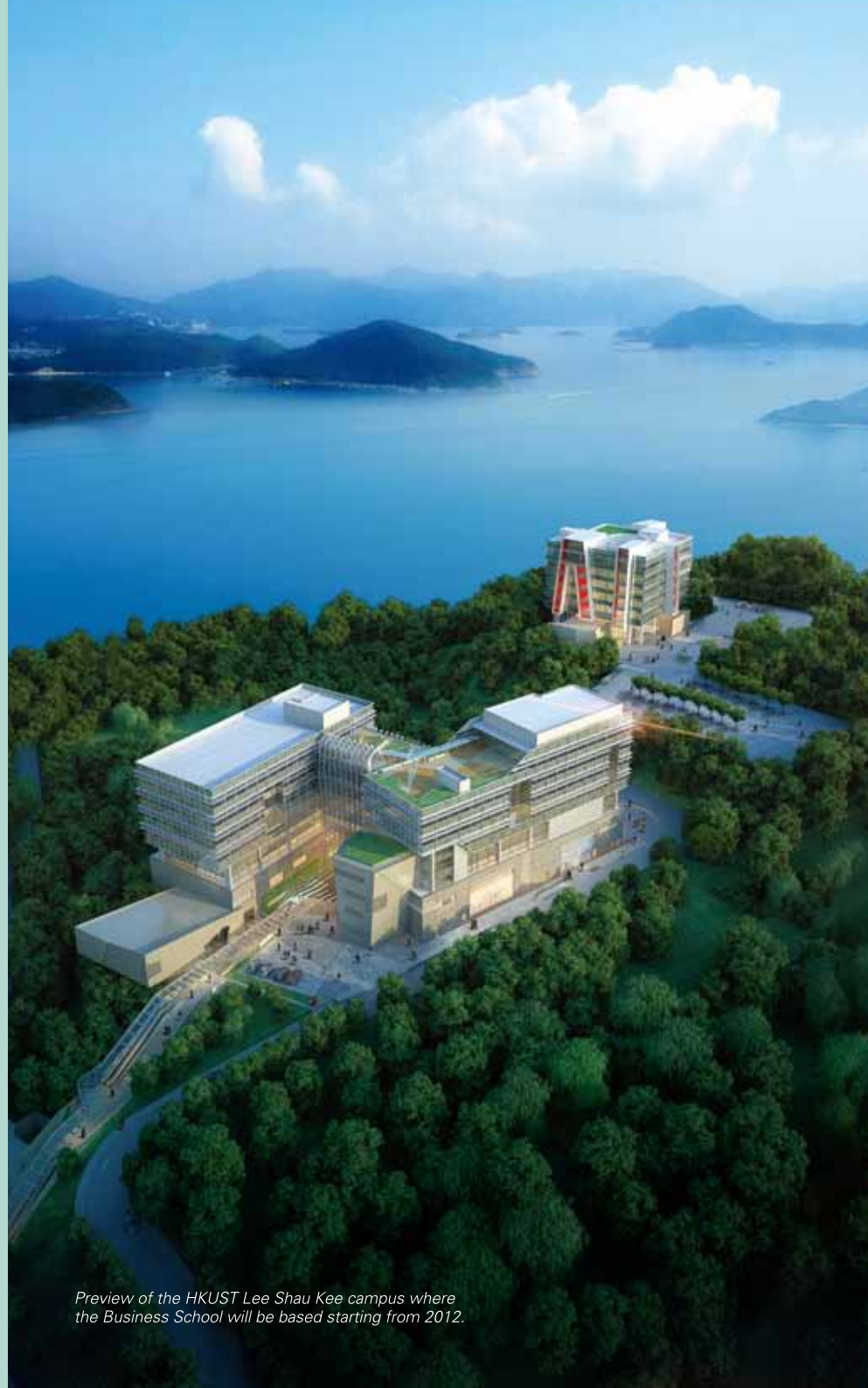
Preview of the HKUST Lee Shau Kee campus where the Business School will be based starting from 2012.