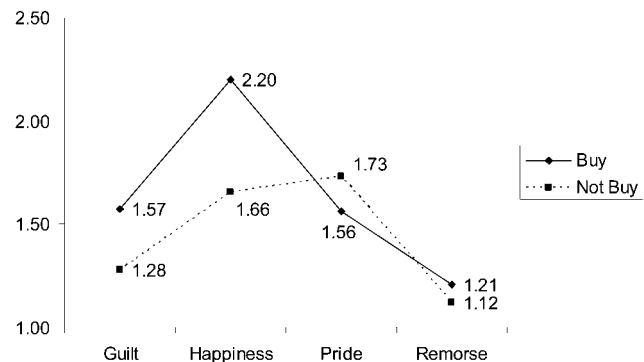
STUDY 1 RESULTS